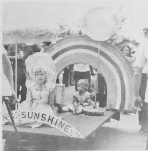
Rain and Sunshine